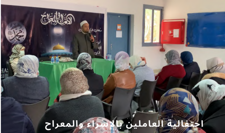
احتفالية العاملين بالإسراء والمعراج

فالاحتفال رمز للتفاؤل والإيجابية، ينير الطريق، يشحن الهمم، يبعث الأمل، يحي القلوب ويجمعها