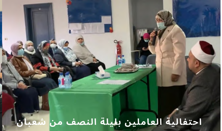
احتفالية العاملين ببليلة النصف من شعبان