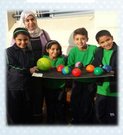
Pr.4 Creating their own solar system by themselves