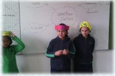
Primary 4 presenting science lesson in a sketch

We build scientific confidence that lasts